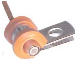
150037 MB-5 micro clamp mounting bracket Stainless Steel, with silicone cushions 0.25" diameter