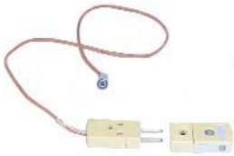
108000 IRt/c connector kit type K thermocouple connectors