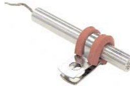
150038 MB-4 APJ-1 clamp mounting bracket Stainless Steel, with silicone cushions 0.38" diameter