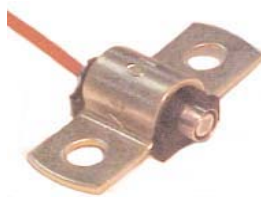
150064 micro Omega clamp metal clamp with rubber cushion for mounting 1.81" x 0.78" (45.97 x 19.81 mm)