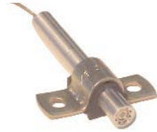
150065 APJ-1 Omega clamp metal clamp with rubber cushion for mounting 1.81" x 0.78" (45.97 x 19.81 mm)