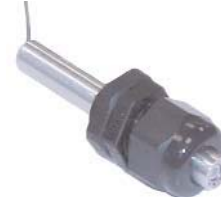
150063 APJ-1 Thru-Fitting plastic fitting with lock nut, sealing nut and hub 1.17" x 0.59" (29.7 x 14.99 mm) PG-7 thread