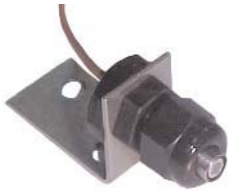
150062 & 836068 micro Thru-Fitting & MB-2 Mounting Bracket plastic fitting with lock nut, sealing nut, and hub 1.17" x 0.59" (29.7 x 14.99 mm) PG-7 thread